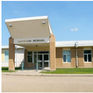
CANWOOD PUBLIC SCHOOL NEWSLETTER

850-1st Street East Box 370 Canwood, SK S0J 0K0